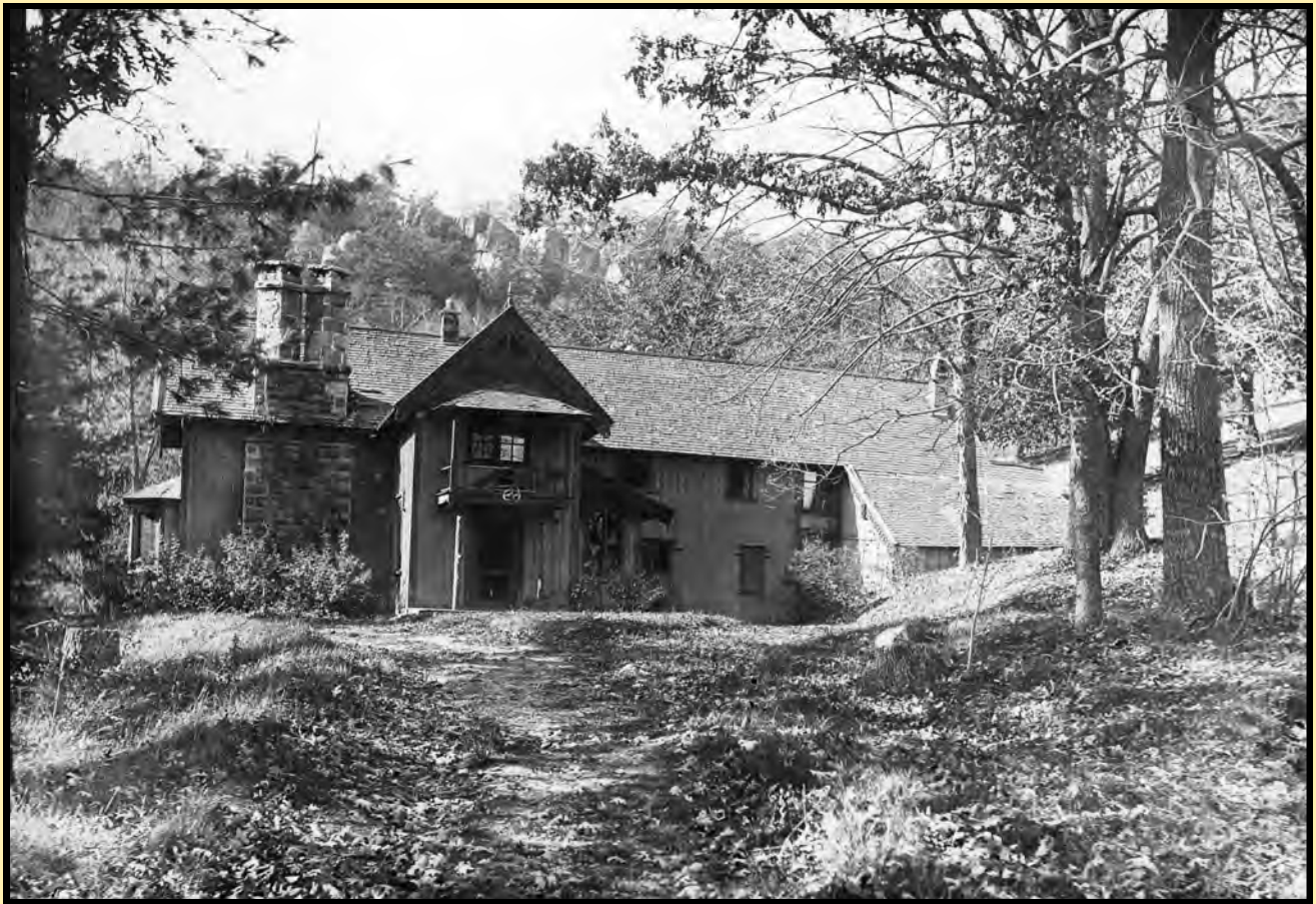
An early settler of Devils Lake, Louis Claude built a large English manor house where the present North Shore Picnic Ground is located.