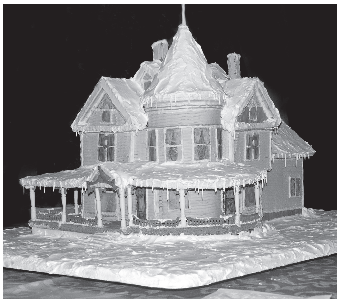
The 1899 Foley House recreated in gingerbread.